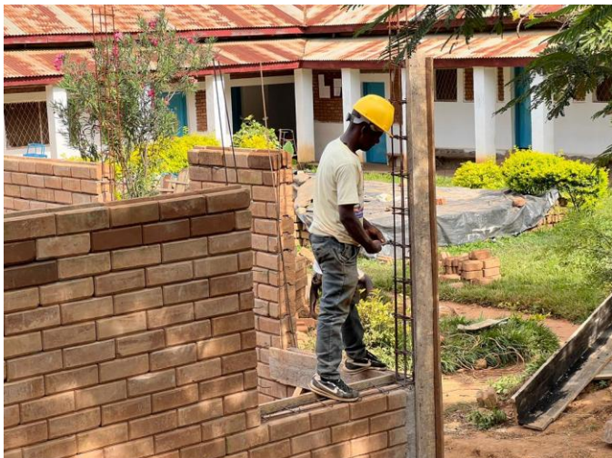
Phase 3 of the Nundu School of Nursing expansion project.

Though the Nundu School of Nursing has been impacted, for the most part classes have remained in session. Yes, the building project to provide dedicated classrooms for the nurse midwife students has been on hold from time to time. Now construction has resumed and funds for the next phases, 3 and 4, have arrived. We have requested that the final report date be reset from April 1 to June 1, but more realistically we are looking at a completion date of July 1.